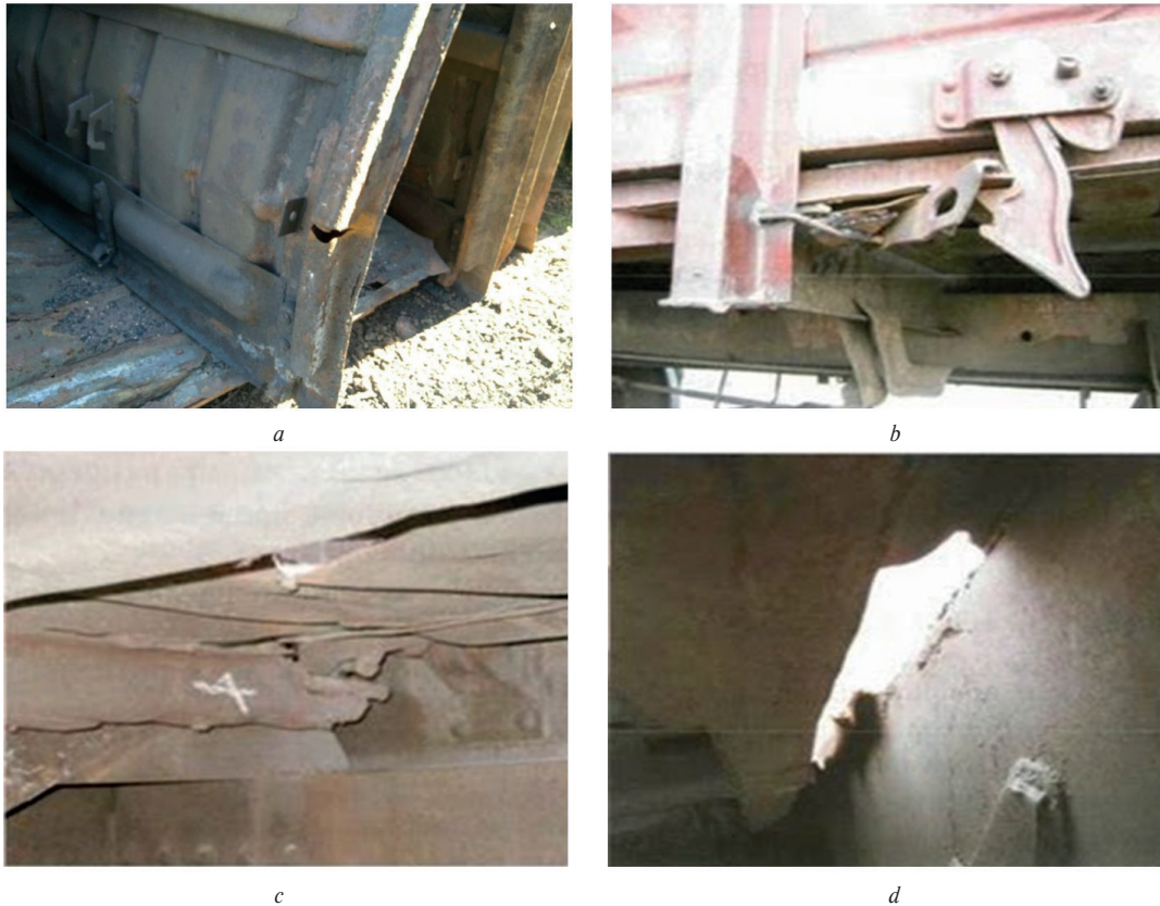
Figure 1 The basic damages in the hatch covers of open wagons in operation: a - break in the framing, b - tear of the locking support, c - damages in the framing, d - tear of the sheet

are studied with advanced methods using ProMechanica and CosmosWorks software. While designing the carrying structure of a carrier, the possibility to use various materials for it is investigated, as well.